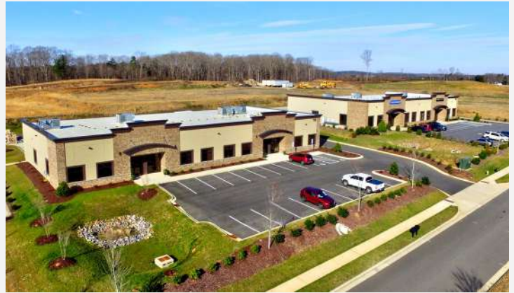
Recent Construction - 128 & 138 Cayuga Dr