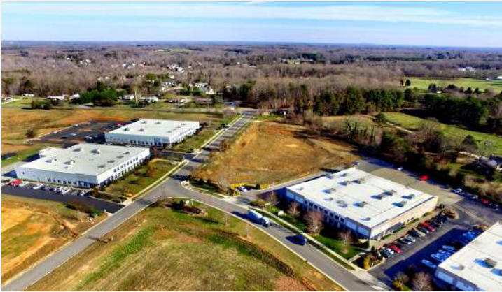
Main Entry at Cornelius Rd and Exmore Rd