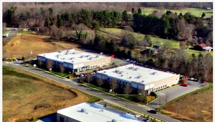
Structure Medical Facility