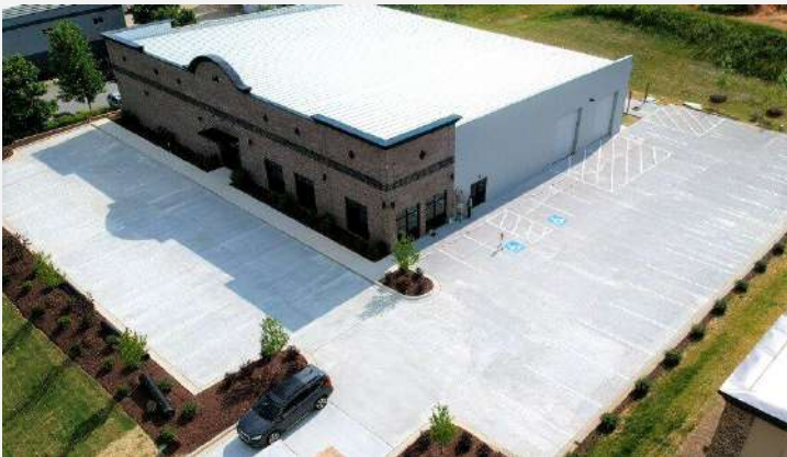
Recent Construction - 146 Cayuga Dr